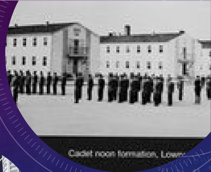
Cadet noon formation, Lowry